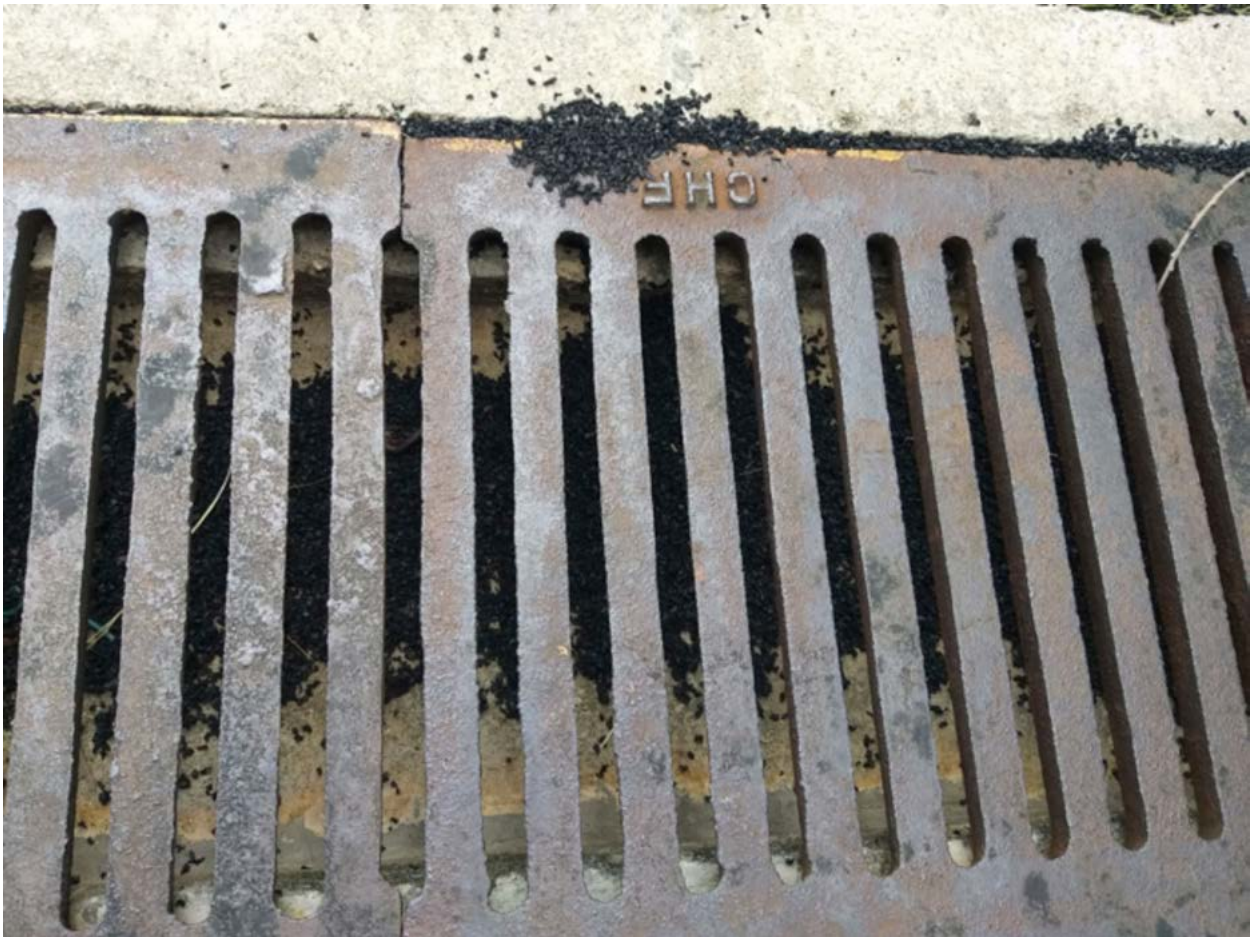
Figure 2b – Infill entering a drain at a pitch in Hong Kong, local to the recently discovered rubber crumb on the beach.

Most studies assume that not all of this ‘lost infill’ necessarily leaks to the environment, as some enters the waste stream and some potentially stays on the pitch through compaction or redistribution 7 . One recent desk-based study used mass-balance calculations comparing monitored losses from field studies to the total weight of infill top-up to suggest that up to 75% of infill top-up is due to compaction 8 . Another recent pilot study by Ecoloop claims that mitigation measures can effectively reduce emissions to zero 9 . Both studies were commissioned by tyre recycling organisations and were limited in scope. We consider these revised figures are likely to be under-estimating loss for the following reasons: