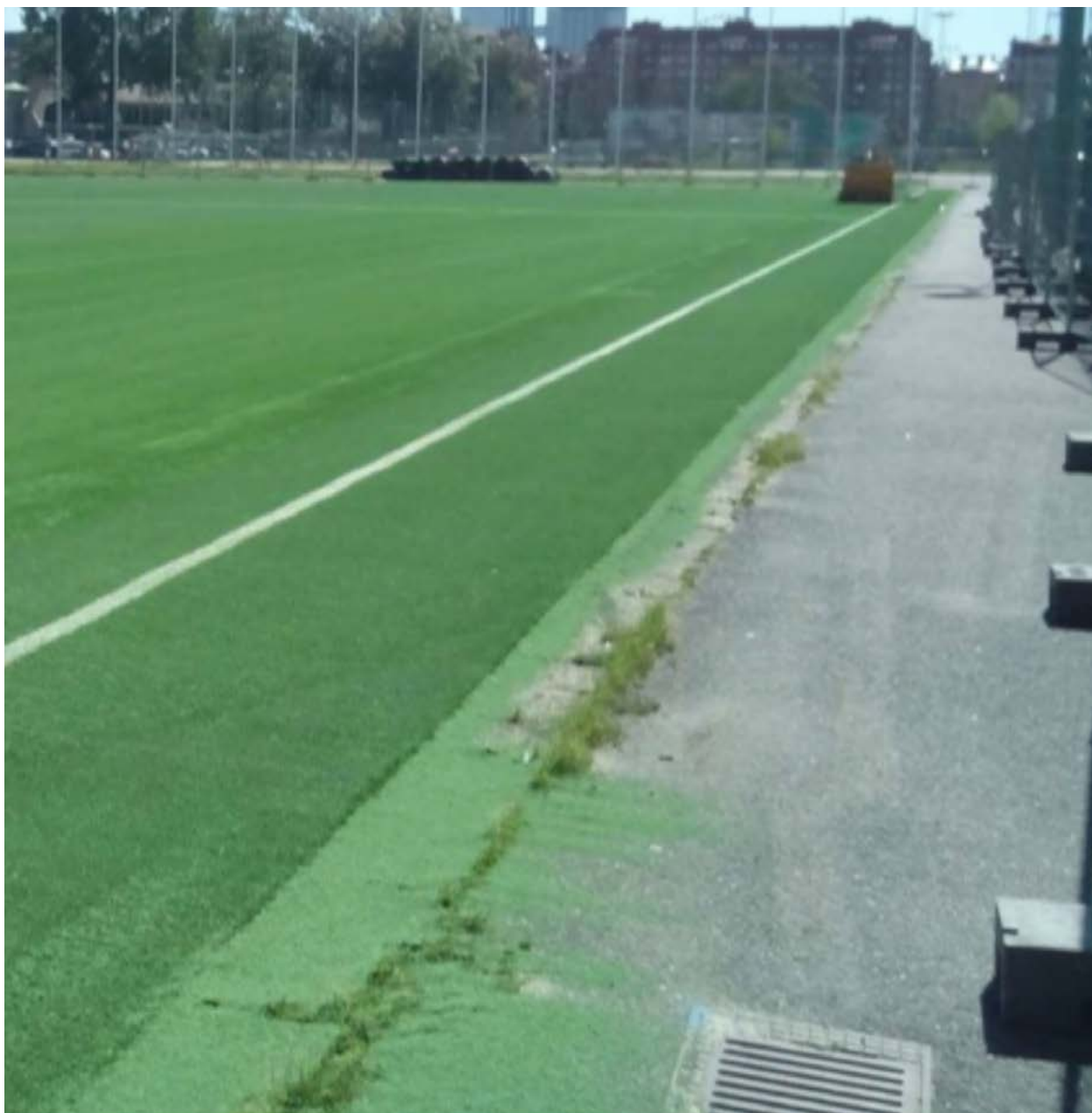
Figure 3 EPDM granules (green) near a drain shortly after installation of a pitch.

Appendix A provides a table of reviewed studies, the estimates of loss they give and key notes regarding methodology.