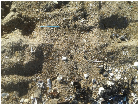
Cotton buds on Gullane Beach