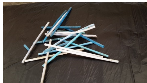
Cotton buds collected from Gullane Beach