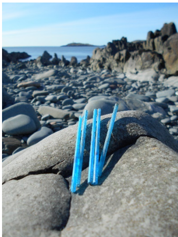
Cotton buds collected in Torrs Cove Bay, Dumfries and Galloway