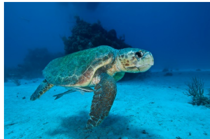
Loggerhead turtle