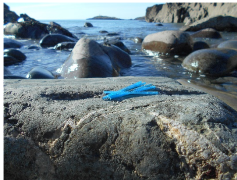
Cotton buds collected at Torrs Cove Bay, Dumfries and Galloway