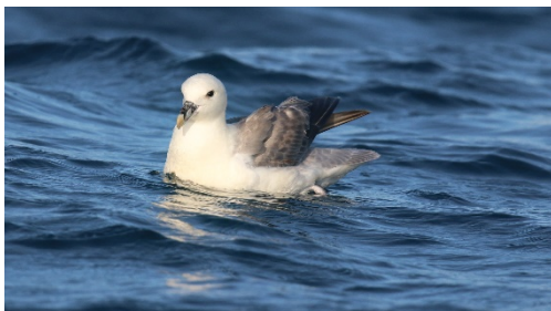
Fulmar