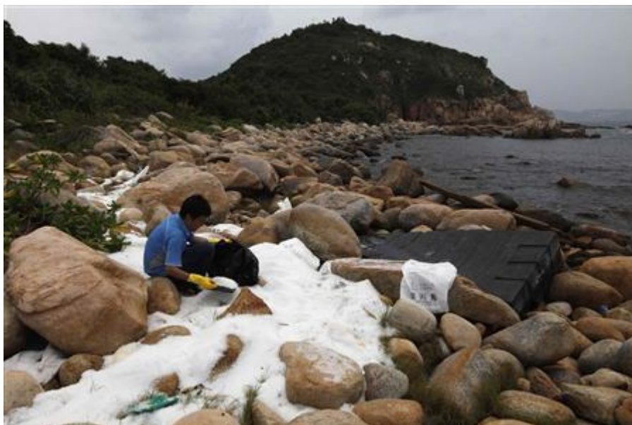
Figure 4: Pellets from the 2012 container spill washed onto Hong Kong's Lamma Island 31