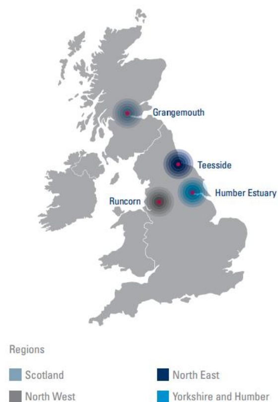
Figure 3: Four Key UK Chemical Clusters 28

On this basis we assume that, mirroring the chemicals industry, 15% of plastics industry is located in Scotland. What this means in terms of Scottish pellet loss is shown in Table 5 and Table 6.